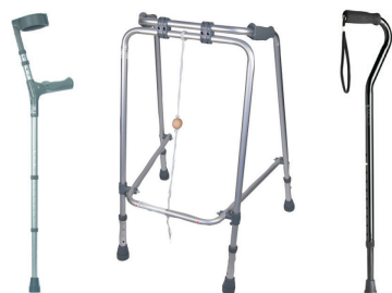
CRUTCHES, FRAMES, STICKS