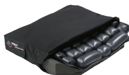
PRESSURE CARE AIR MATTRESSED & CUSHIONS