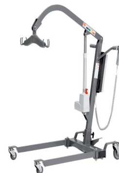
LIFTERS & SLINGS