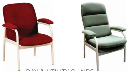
DAY & UTILITY CHAIRS