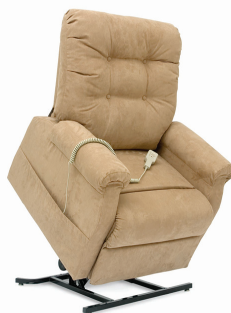
LIFT & RECLINE CHAIRS