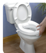
TOILET SEAT RAISERS & OVER TOILET AIDS